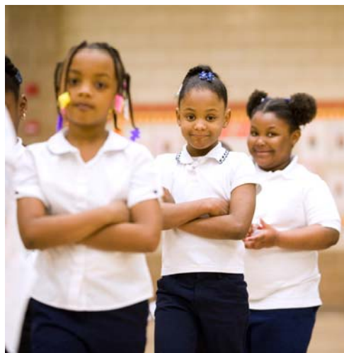
Students line up for class.

AUSL began another school year with three new turnaround schools: Johnson School of Excellence (North Lawndale), Dulles School of Excellence (Greater Grand Crossing) and Bethune School of Excellence (East Garfield Park). The addition of these schools brings AUSL's total to 14 and almost 8,000 students.