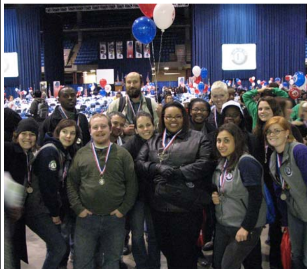
AUSL’s AmeriCorps Members at National Service Recognition Day in Springfield, IL on October 15.

A new AmeriCorps grant from the Corporation for National and Community Service offers 28 AUSL secondary residents the opportunity to earn a $4,725 Education Award that can be used to pay qualified student loans or future tuition at a qualified institution of higher education. This grant supports residents’ service at an AUSL network school while training to become a new teacher.